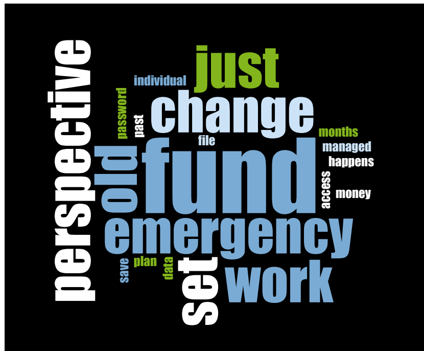
Figure 3 Word cloud – Students in tertiary education retirement capability Twenty (20) most frequent words

These results inform on the vocabulary terms preferred by the sample in the post-campaign phase to refer to items, concepts and practices related to retirement capability.