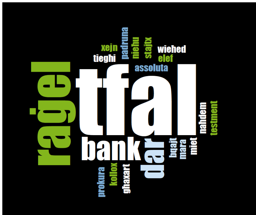
Figure 3 Word cloud – Widows and Widowers on retirement capability Twenty (20) most frequent words

Figure 3 graphically presents the twenty (20) most frequent words found in the widows' and widowers' focus group data set that were coded as related to retirement capability. The same analysis results are presented in table format in Table 3.