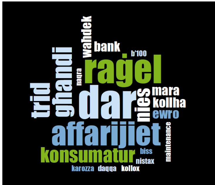
Figure 1 Word cloud – Widows' / Widowers' household and lifestyle Twenty (20) most frequent words

These results inform on the vocabulary terms preferred by the sample representing the widows' and widowers' cohort to refer to items, concepts and practices related to the financial aspects of household and lifestyle.