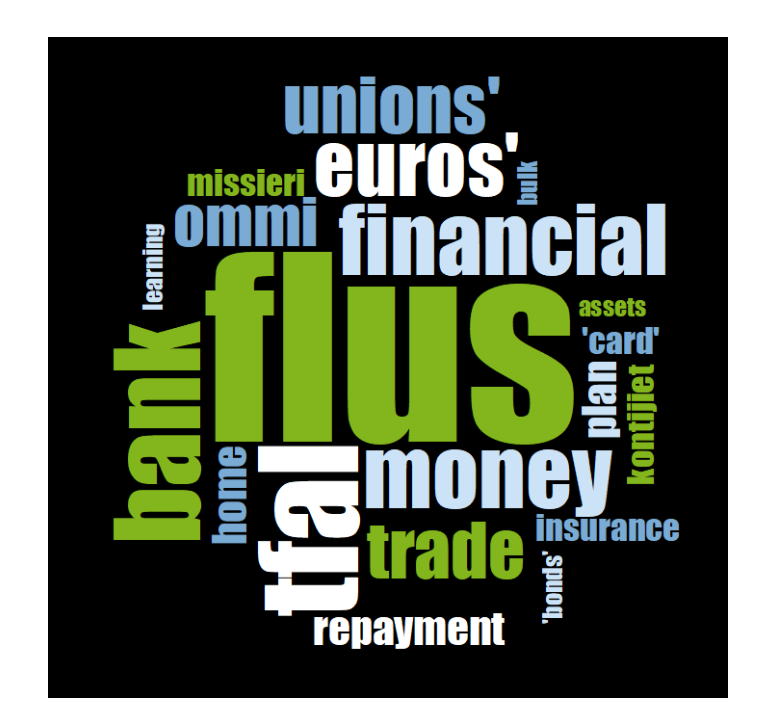
Figure 4 Word cloud - UP end-user engagement with awareness campaigns Twenty (20) most frequent words

These results inform on the vocabulary terms preferred by the sample representing the UP cohort to refer to items, concepts and practices related to end-user engagement with awareness campaigns.