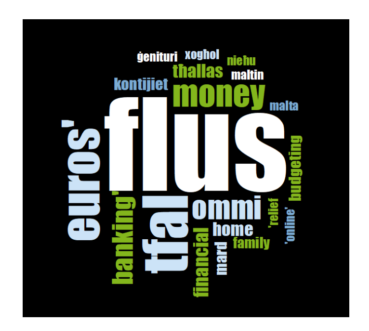
Figure 1 Word cloud - UP household and lifestyle Twenty (20) most frequent words

Figure 1 graphically presents the twenty (20) most frequent words found in the UP focus group data that was coded as related to household and lifestyle. The same analysis results are presented in table format in Table 1.